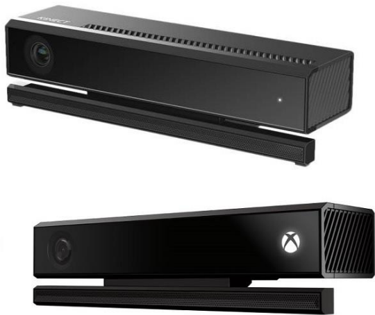
Kinect 2 Sensors

MOSCOW, RUSSIA November 6, 2014 – iPi Soft, LLC , developers of the iPi Motion Capture line of markerless motion capture technology, today announced the availability of iPi Motion Capture Version 3.0 . The next generation motion capture solution delivers a number of impressive new features for improved workflow, including support for the new Microsoft Kinect 2 sensor, increased tracking speed, improved arm and leg tracking and a simplified calibration process that gives even entry level motion capture enthusiasts the ability to obtain quality mocap data easily and quickly.